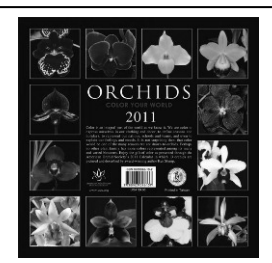
2011 AOS Calendars