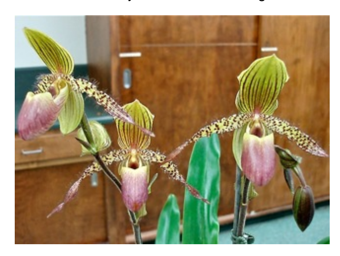
Paph. Transdoll Liemianum x Rothschildianum