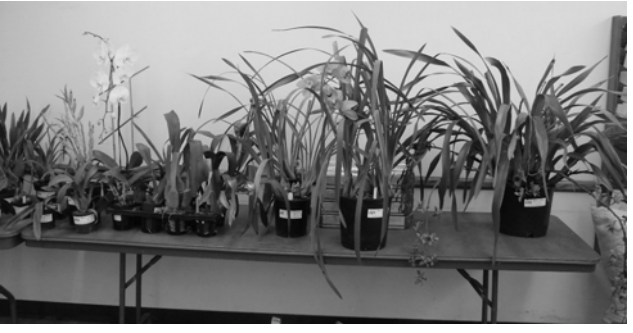
Beautiful Plants for Sale