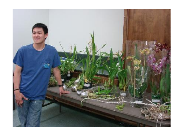
Beautiful Plants for Sale