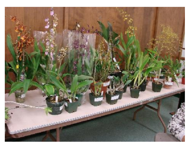
Plenty of Plants to Auction