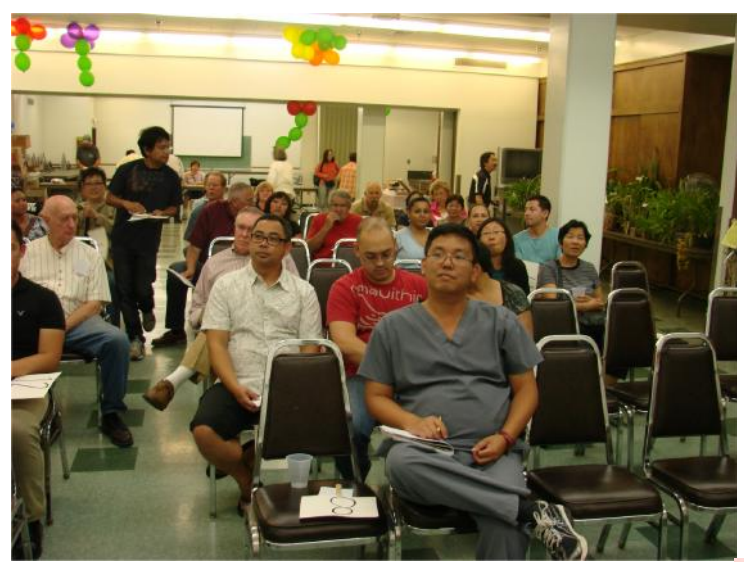
SGVOH Members and Guests